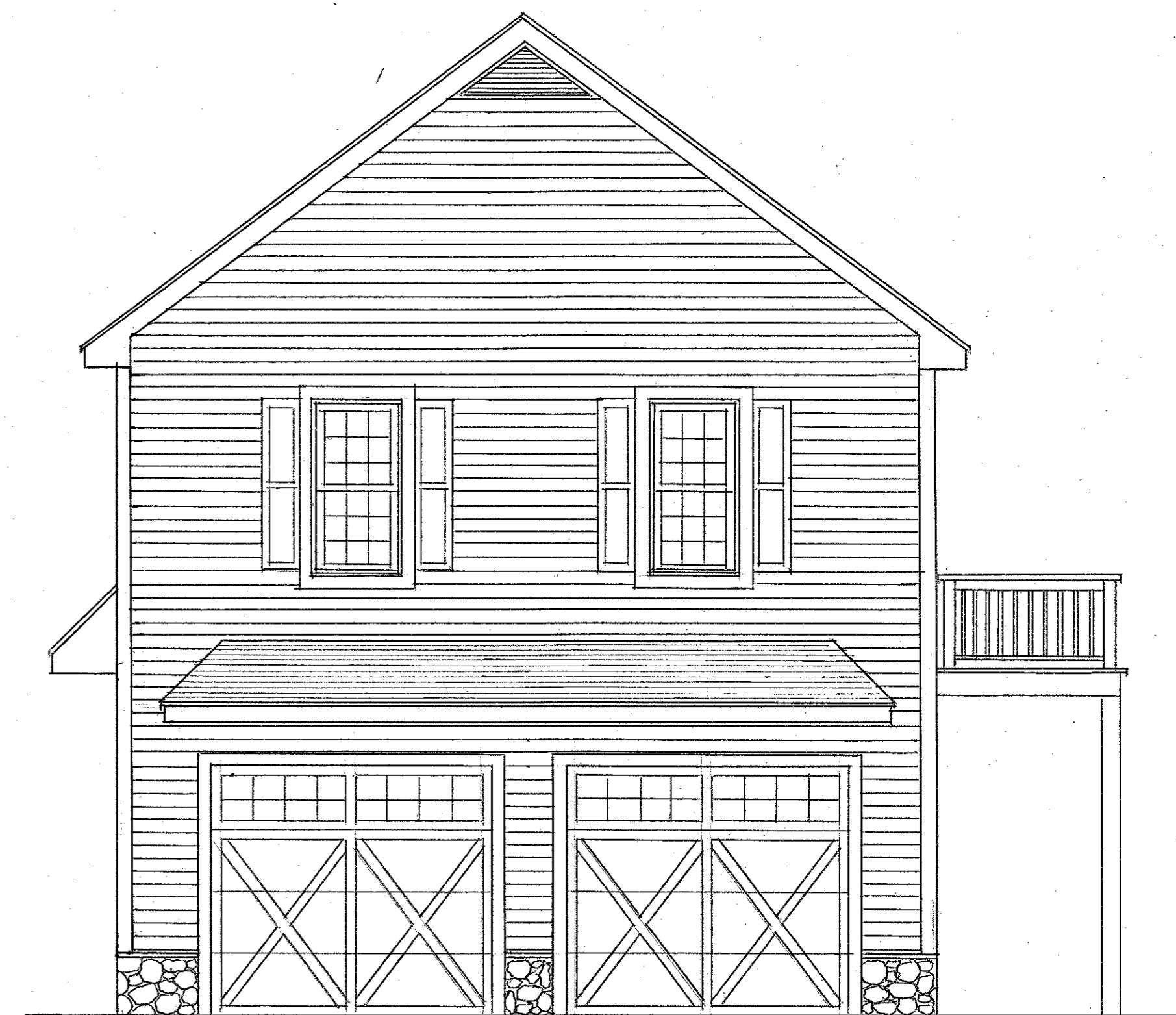
RIGHT SIDE ELEVATION 1/4"=1'-0"